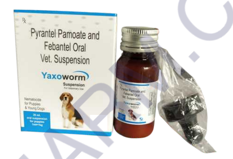
Packing : 30 With Dropper M.R.P. Rs. : 150 /-

Prevention of Heartworm, Fleas And Ticks.